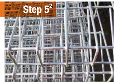
Step 5 2