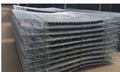
PANEL & POST PACKAGE