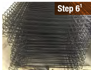
Step 6 1