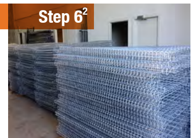
Step 6 2